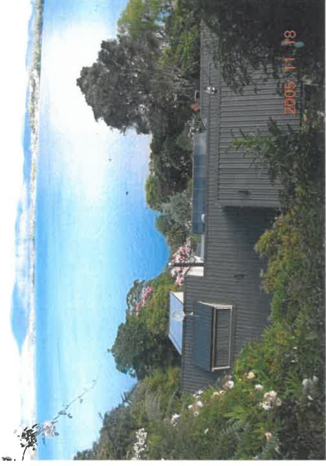
View from halfway down driveway