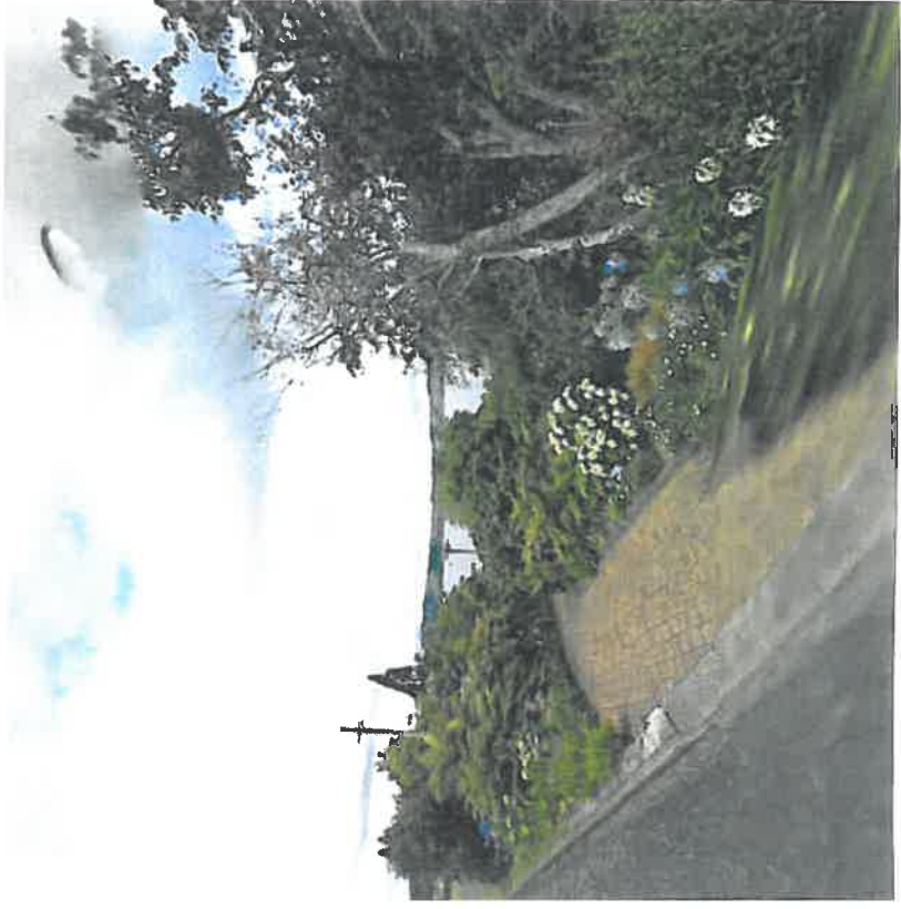
View from Kawaha Point Road down driveway